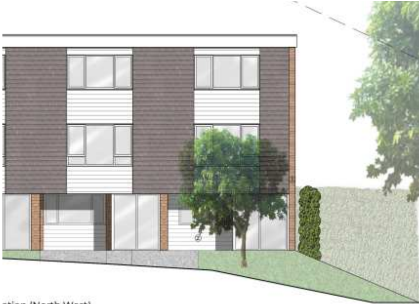
ation (North West)